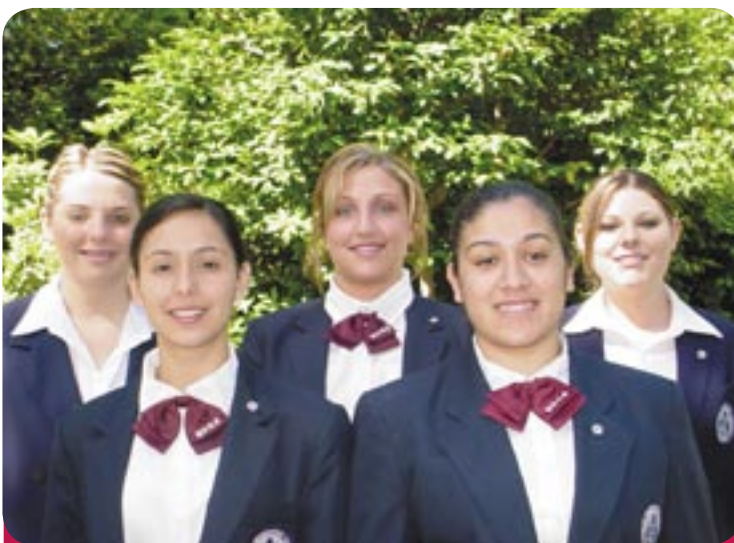
Meet your new state officer team on Page 4!