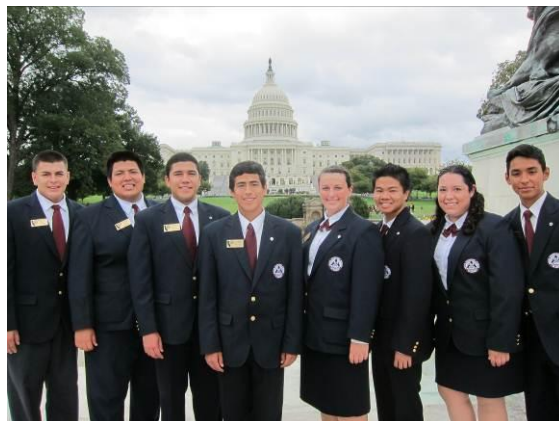
California HOSA State Officers at the Washington Leadership Academy in Washington D.C.